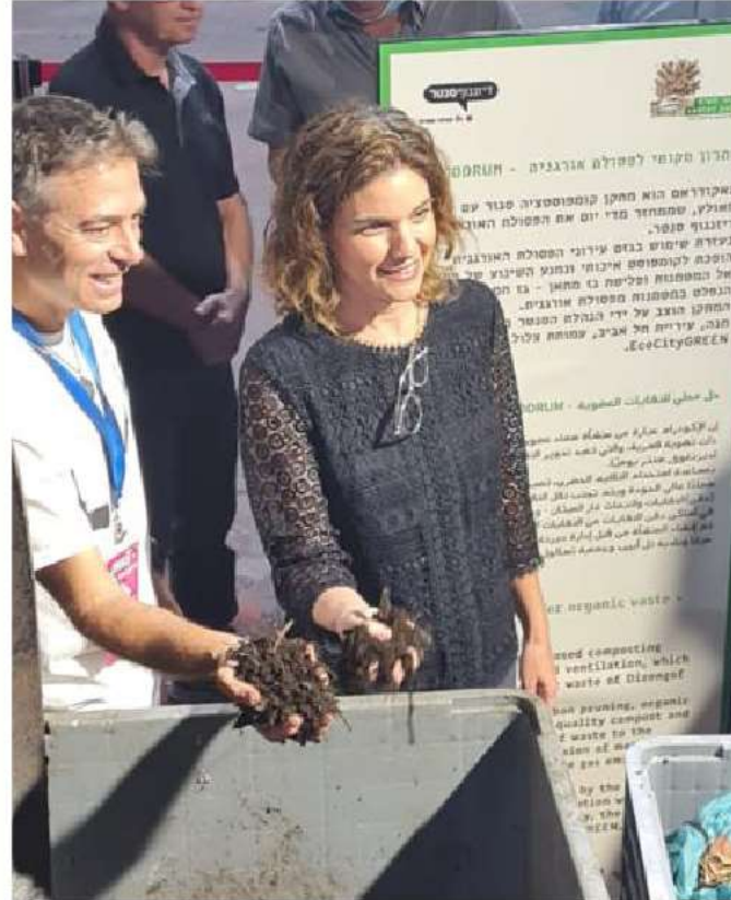
Tamar Zandberg Minister of Environmental Protection